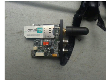
A device equipped with a SIM card found in a vehicle in Italy, in August 2019 5 .