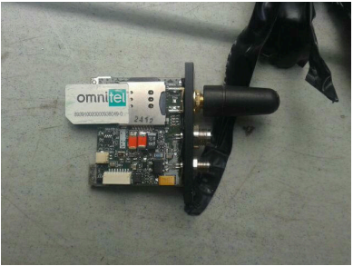
A device equipped with a SIM card found in a vehicle in Italy, in August 2019. 5