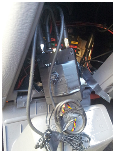
Microphones and a GPS tracker found in the fuse box of a car in Lecce, Italy, in December 2017. 2