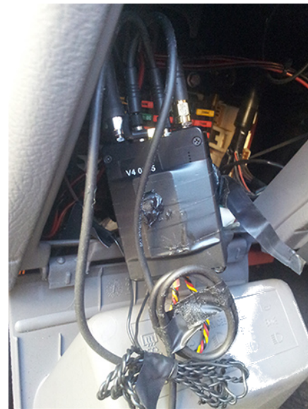
Microphones and a GPS tracker found in the fuse box of a car in Lecce, Italy, in December 2017. 2