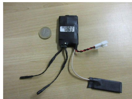
Microphones found inside a power outlet in a building in Bologna, Italy, in January 2018 1 .

Hidden physical surveillance devices are typically used by law enforcement and intelligence agencies to obtain information about a target when traditional surveillance methods are insufficient. For example, if a suspect never talks about sensitive topics on the phone—making the monitoring of their phone useless—law enforcement may resort to installing a hidden microphone in the suspect's home, in the hope of capturing interesting conversations. In many countries, the installation of such devices is regulated by law and must be approved by a judge.