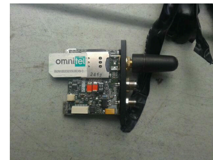
A device equipped with a SIM card found in a vehicle in Italy, in August 2019. 5