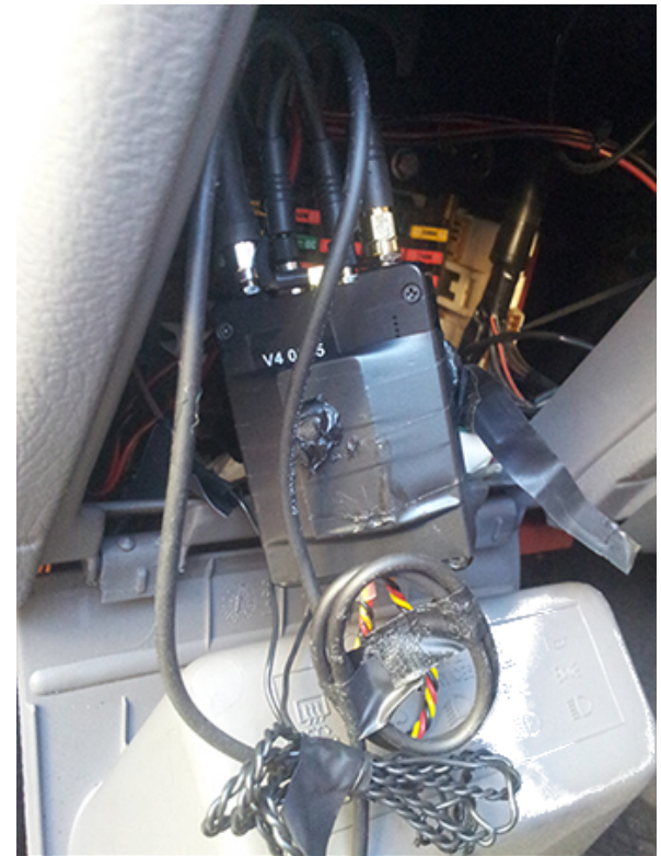
Microphones and a GPS tracker found in the fuse box of a car in Lecce, Italy, in December 2017 2 .