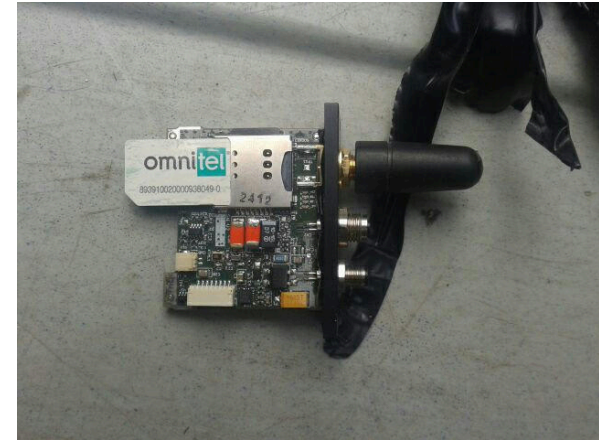
A device equipped with a SIM card found in a vehicle in Italy, in August 2019 5 .