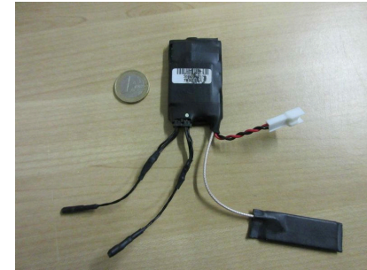
Microphones found inside a power outlet in a building in Bologna, Italy, in January 2018. 1

Hidden physical surveillance devices are typically used by law enforcement and intelligence agencies to obtain information about a target when traditional surveillance methods are insufficient. For example, if a suspect never talks about sensitive topics on the phone—making the monitoring of their phone useless—law enforcement may resort to installing a hidden microphone in the suspect's home, in the hope of capturing interesting conversations. In many countries, the installation of such devices is regulated by law and must be approved by a judge.