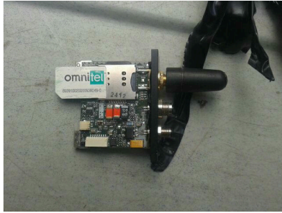
A device equipped with a SIM card found in a vehicle in Italy, in August 2019. 5