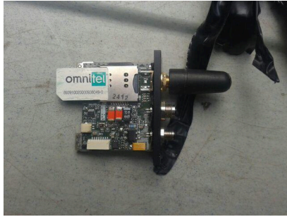
A device equipped with a SIM card found in a vehicle in Italy, in August 2019. 5