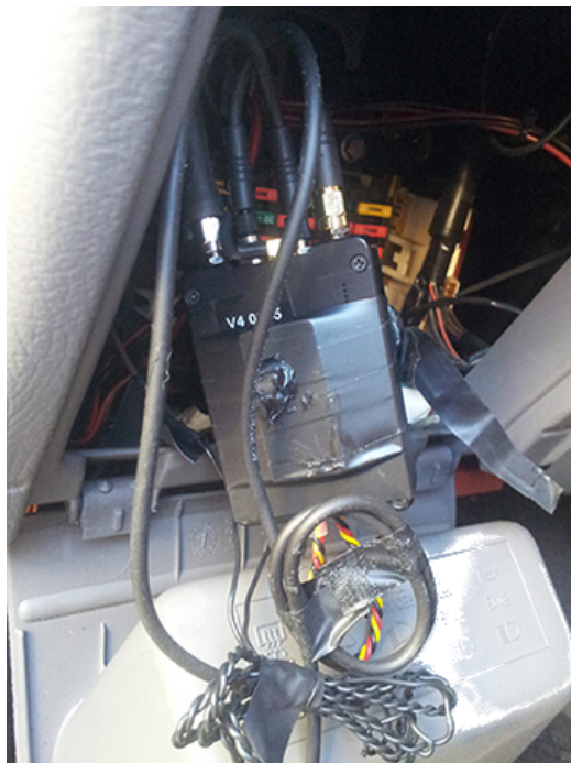
Microphones and a GPS tracker found in the fuse box of a car in Lecce, Italy, in December 2017. 2