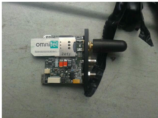
A device equipped with a SIM card found in a vehicle in Italy, in August 2019. 5