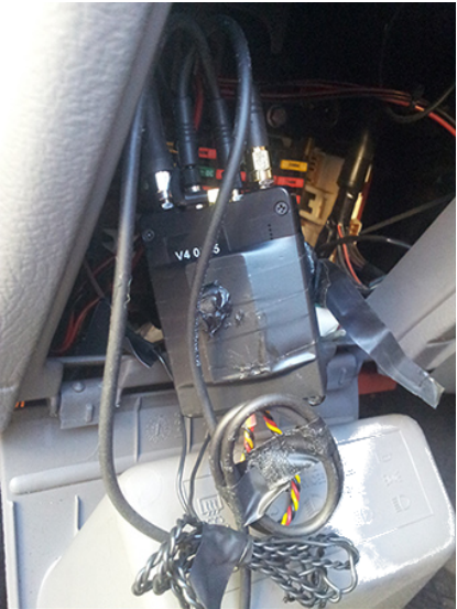
Microphones and a GPS tracker found in the fuse box of a car in Lecce, Italy, in December 2017. 2