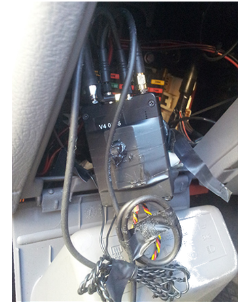
Microphones and a GPS tracker found in the fuse box of a car in Lecce, Italy, in December 2017 2 .