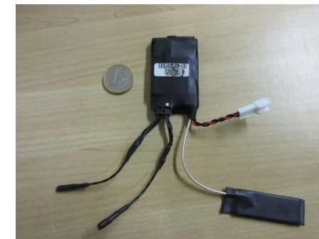
Microphones found inside a power outlet in a building in Bologna, Italy, in January 2018 1 .

Hidden physical surveillance devices are typically used by law enforcement and intelligence agencies to obtain information about a target when traditional surveillance methods are insufficient. For example, if a suspect never talks about sensitive topics on the phone—making the monitoring of their phone useless—law enforcement may resort to installing a hidden microphone in the suspect's home, in the hope of capturing interesting conversations. In many countries, the installation of such devices is regulated by law and must be approved by a judge.