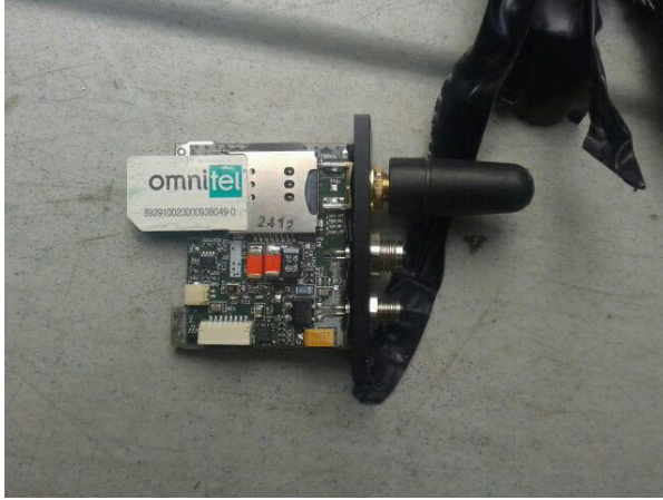
A device equipped with a SIM card found in a vehicle in Italy, in August 2019 5 .