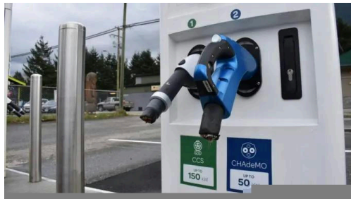
Electric vehicle charging station with severed cables.

As more Teslas hit the road, the state's surveillance network expands; the supposed line between “citizen” and “cop” vanishes. The same surveillance technology that Tesla has pioneered is being introduced by other car manufacturers and after-market manufacturers. A new feature by BMW allows users to generate a live 3D render of their car's surroundings from a smartphone app. Other companies are not far behind, teasing features that are similar to Tesla's sentry mode.