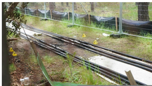
Six high-voltage cables supplying power to the site of a Tesla “gigafactory” were torched near Berlin, Germany in May 2021. Translated from the communique 24 : “Our fire opposes the lie of the ecological car”.

human and non-human animals in massive numbers, and systems of surveillance and control continue to be refined and expanded. Tesla, along with other electric vehicle manufacturers, can and should be attacked by anarchists. It can be attacked at many levels: the network of charging stations is vulnerable to sabotage 22 , the vehicle lots and buildings can be attacked, and the cars themselves can be easily damaged or destroyed 23 .