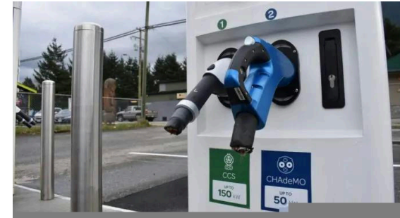
Electric vehicle charging station with severed cables.

feature by BMW allows users to generate a live 3D render of their car's surroundings from a smartphone app. Other companies are not far behind, teasing features that are similar to Tesla's sentry mode.