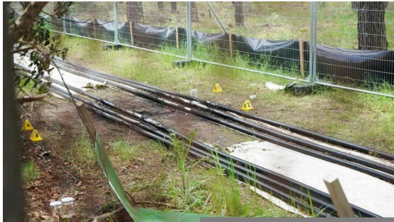
Six high-voltage cables supplying power to the site of a Tesla “gigafactory” were torched near Berlin, Germany in May 2021. Translated from the communique 24 : “Our fire opposes the lie of the ecological car”.

control continue to be refined and expanded. Tesla, along with other electric vehicle manufacturers, can and should be attacked by anarchists. It can be attacked at many levels: the network of charging stations is vulnerable to sabotage 22 , the vehicle lots and buildings can be attacked, and the cars themselves can be easily damaged or destroyed 23 .