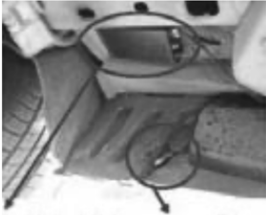
Installation of a GPS transmitter next to the rear wheel arch, in this case the GPS receiving antenna (at the very bottom) separate from the rest of the module.

are tied to surveillance activities or the deployment of personnel on site, i.e. above all the use of video cameras, eavesdropping devices and GPS tracking devices and, in practice, mostly in connection with Section 163 measures.