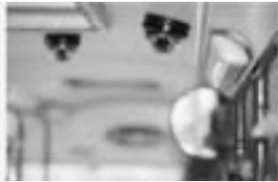
Above all, the inconspicuous camera “domes” are becoming more and more common in the cityscape.

With the increase in public video cameras and the advancement of biometric software, it may become possible to track a person's movement through the streets of the city. The automated identification of people via video is theoretically well advanced, but in practice it is still prone to errors. In practice, this will only play a marginal role for surveillance in the foreseeable future, because the personnel effort required to analyze this data in real time is quite high. Such surveillance techniques are more likely to become more important for retrospective investigations.