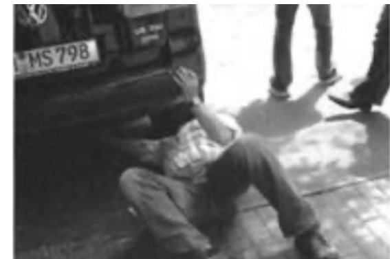
A GPS transmitter is placed, the technician is secured by two officers.