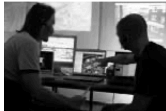
MEK officers planning operations.

A surveillance team conducts team meetings every week. New cases are presented and the surveillance plan is developed. Who leads the surveillance squad on site, the squad leader or a subordinate official? How many people and cars are used for the case, which working hours and how many days are reserved, which technical means are