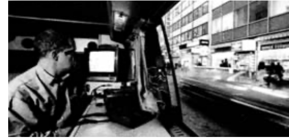
Official inside a camouflaged van (elevated position). The large window on the right is mirrored or heavily darkened.

Ultimately, the basic aim of police surveillance is the conviction of offenders and the conviction of the target by a court. If this seems