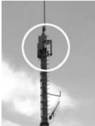
TETRA antenna (very similar to cellphone antennas; three antennas are a characteristic feature).

Some facts about “Terrestrial Trunked Radio”: TETRA is a digital radio process, created by an international consortium of companies based in Rome. With its takeover in Germany and other EU countries, TETRA will presumably establish itself as a Europe-wide digital standard.