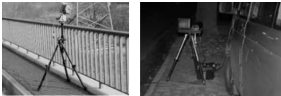
Two license plate scanners in test use.

Various models of optical scanners for license plates are already being tested by the police, for example, in connection with toll systems—these could be used in the future for automated detection and recording video footage of vehicles. These readers look similar to mobile radar speed cameras and can occasionally be seen at the edge of highways.