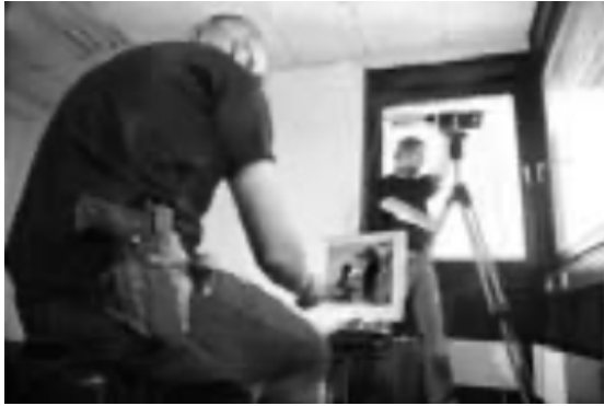
MEK officers working in a conspiratorial apartment.

Cars with hidden/camouflaged cameras in an otherwise open interior are less conspicuous, but have the disadvantage that the camera has to be realigned to the target after each time the vehicle moves. Such cars are therefore used for recording the comings and goings at a fixed destination over a long period of time. The issue of storage capacities and battery power arises here, especially in the cold of winter, which is why such vehicles have to be regularly serviced. Usually, a stationary camera is positioned as close as possible to the target property in order to avoid any obstructions to the line of sight. Only when there is no alternative is a camera vehicle parked on the other side of the street, because traffic flows significantly obstruct the desired viewpoint and nobody is present to bridge gaps in surveillance.