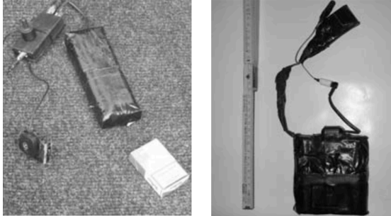
Left: GPS transmitter from the LKA Schleswig-Holstein (2007), GPS antenna and battery set separately.

though this is a little more complex because there are only a few possible hiding spots. It is very difficult with bicycles because they can only be concealed in the frame, which is not very promising due to the shielding effect of the metal. Alternatives could be a permanently installed lighting system such as the dynamo (electrical generator for bicycles employed to power a bicycle's lights) and plastic parts with cavities such as reflectors and lighting. For a target, however, it is very possible to quickly examine a bicycle for foreign objects.