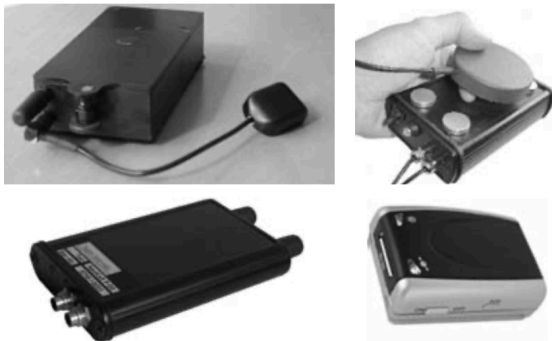
Four classic or commercially available GPS tracking modules from the years 2007–2009.