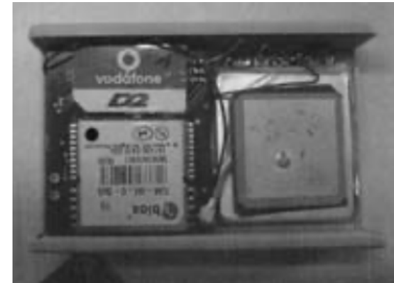
Inside view of a GPS tracking module. At the top left the GSM card for transferring data via cellular network.

Secondly, preventive surveillance that is not directed against a specific target. During every major police operation, civil reconnaissance forces observe the environment and potential dangers of a demonstration or football game, etc., whereby individual “officially known” persons are also observed and sometimes followed for longer. Various departments cooperate here and communicate with special control centers, whose findings flow together through the management team. During large-scale operations such as May 1st in Berlin, more than 100 undercover vehicles from police departments to the riot police to the MEK can be used for surveillance. There is also pre-