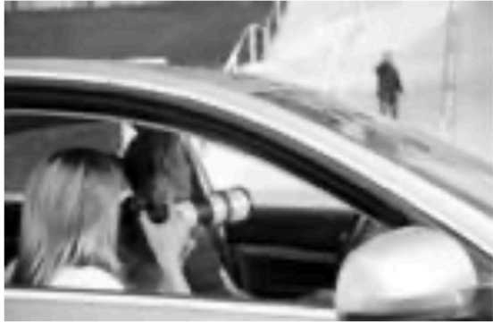
MEK officers on surveillance duty.

In every crime film we see a suspicious person driving away in a car and the policeman who is following them immediately pulling their car out ten meters behind to initiate the pursuit. In reality, this is, of course, completely impractical because the target could notice it. When the “target vehicle” (TV) starts to move, the vehicle in the A-position stops and waits while another vehicle from a greater distance follows. There is almost always enough time between the target getting into the car and driving off to bring another surveillance vehicle into position. Sometimes the vehicle even sits in front of the TV and allows the TV to overtake it once.