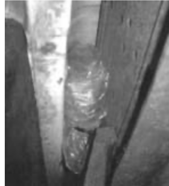
Tracking module attached to the underside of the vehicle in a cavity. It is wrapped in plastic to protect it from splashing water. In winter, packaging also increases the service life of the battery (protection against discharge through cold).

Surveillance, according to Section 100 of the Code of Criminal Procedure (§100 StPO), is usually implemented very quickly after the judicial decision. In particular, telecommunications surveillance (TCS), which includes telephone monitoring and all online activities such as email, internet, etc., can be set up without any difficulty. Most commercial providers only need a fax or, in the case of “imminent danger”, a call from the investigating authority to fulfill their legal obligation to activate surveillance. Other areas of §100 StPO