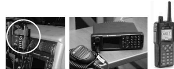
TETRA devices currently in use: hand-held device permanently installed in the car; MRI (base unit) from Motorola; HRT (hand-held) from Sepura.

When the judicial decision and the public prosecutor's order for enforcement are in place, the officer responsible for the case turns to